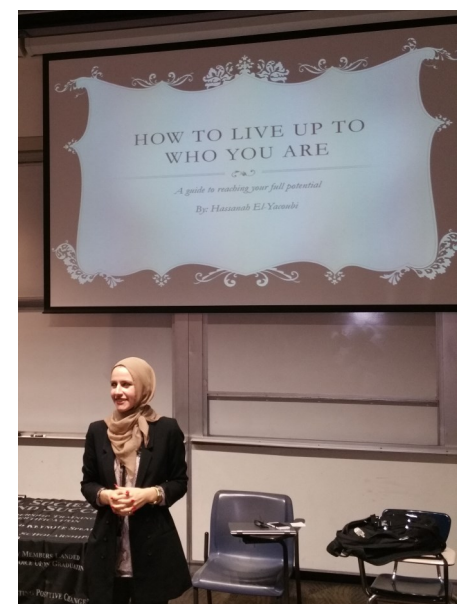
Presenting to the UCR chapter of the National Society of Leadership and Success.

I was recently invited to speak on campus at the National Society of Leadership and Success (UCR Chapter), which is an organization dedicated to helping students enhance their leadership skills and their ability to fulfill their potential through engagement on campus. I shared useful tips that helped me overcome obstacles and challenges within my career and throughout my path to graduate school.