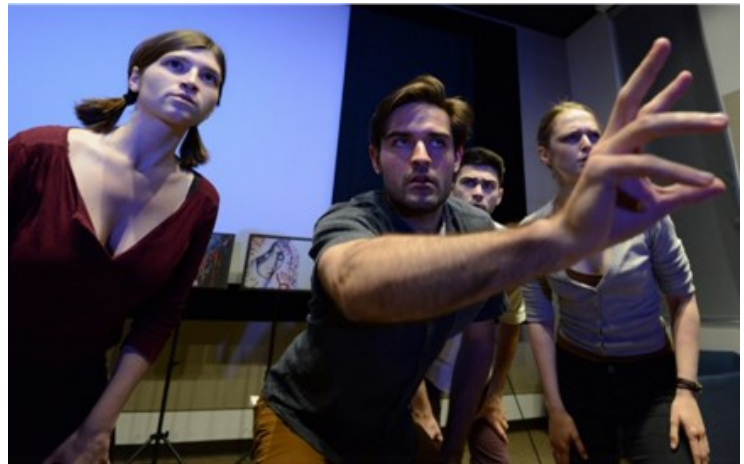
Performers from the play Kultar's Mime